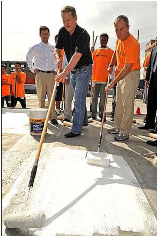
Former Vice President Al Gore and New York City Mayor Michael Bloomberg paint the rooftop of the YMCA in Queens.

But the city still hasn't started painting 1 million square feet of roof space on municipal buildings like homeless shelters, police precincts, fire stations and sanitation garages.