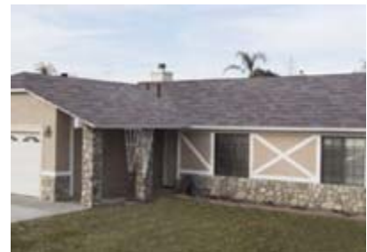
Before: Hot roof, with gray asphalt