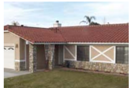
After: Cool Roof, with red clay tile